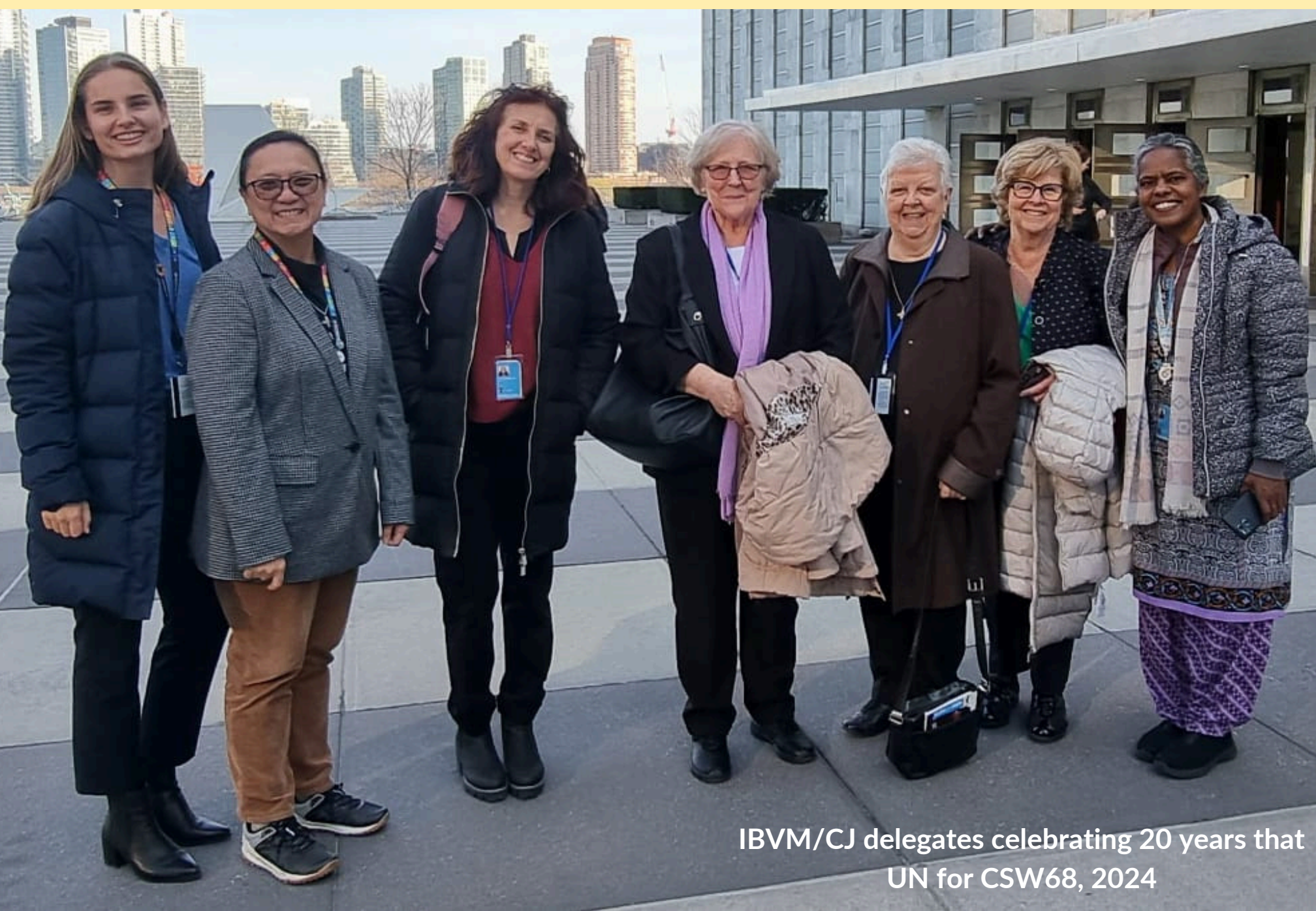
IBVM/CJ delegates celebrating 20 years that UN for CSW68, 2024

The Institute of the Blessed Virgin Mary (IBVM) and the Congregation of Jesus (CJ) work in collaboration at the UN as a Non-Government Organisation (NGO).