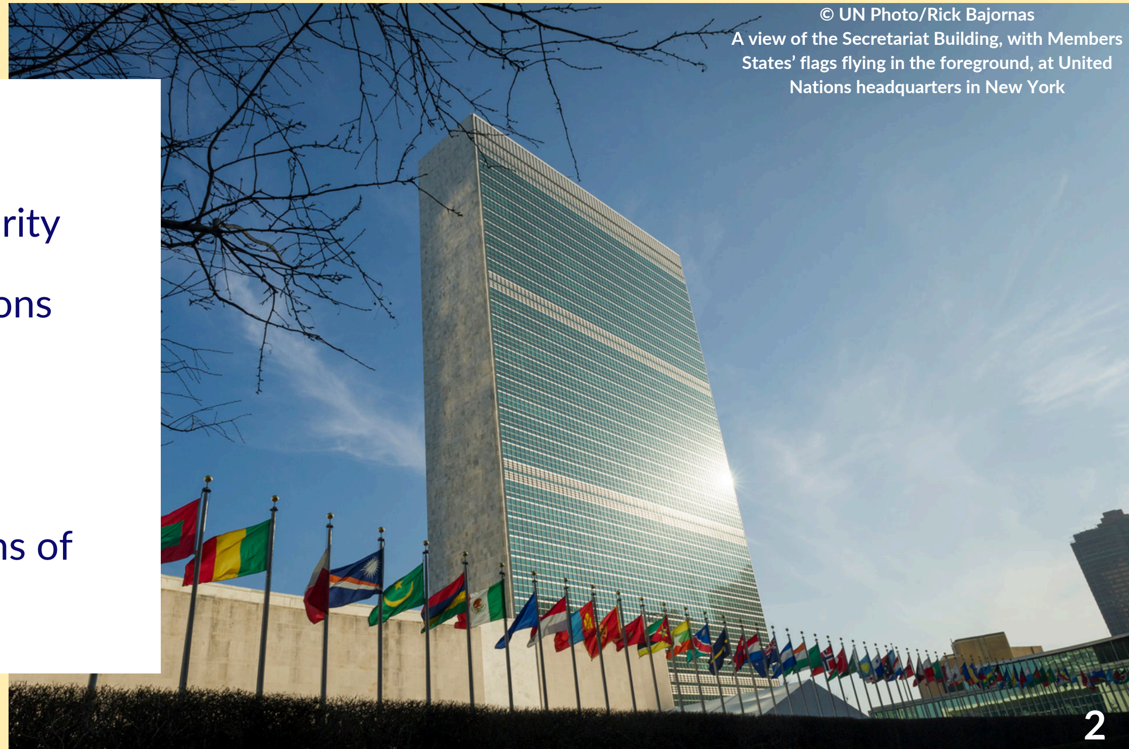
A view of the Secretariat Building, with Members States' flags flying in the foreground, at United Nations headquarters in New York